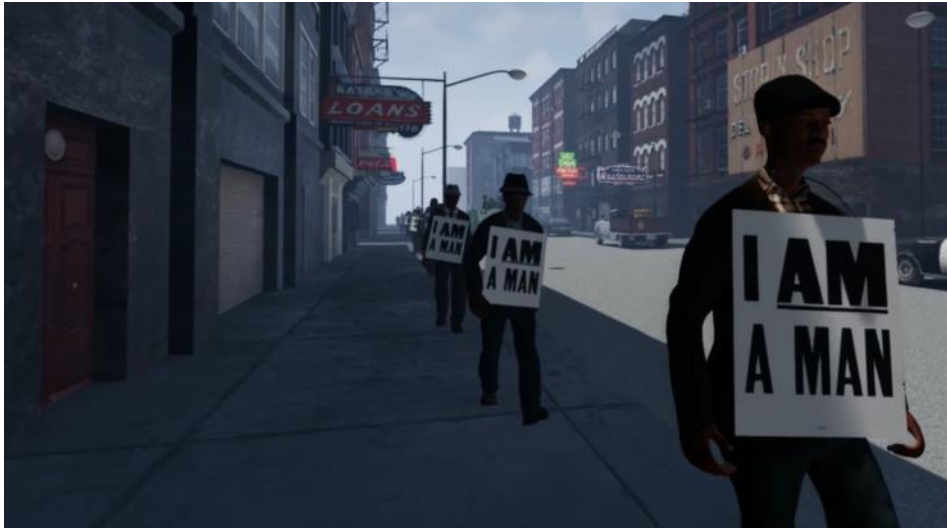
Figure 7: Screenshot of the VR game "I AM A MAN"

Another VR experience entitled "I Am A Man" makes the history of the American civil rights movement of African Americans tangible. The VR presentation aims to provide personal understanding of the struggles of marginalized groups. The title uses historical film footage, photographs, and voice recordings of actual participants in the civil rights movement. "I Am a Man" sees itself as an interactive documentary experience to provide a deeper awareness of anti-racist struggles (Meta, 2023). 38