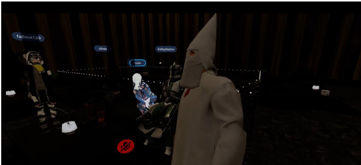
Figure 5: Screenshot from VR Chat. A person in a KKK outfit harassed other players, source: VRChat, 2022

narratives, but also to arouse interest. For example, players in Ku Klux Klan outfits have appeared in the VRChat game and given racist monologues. 29