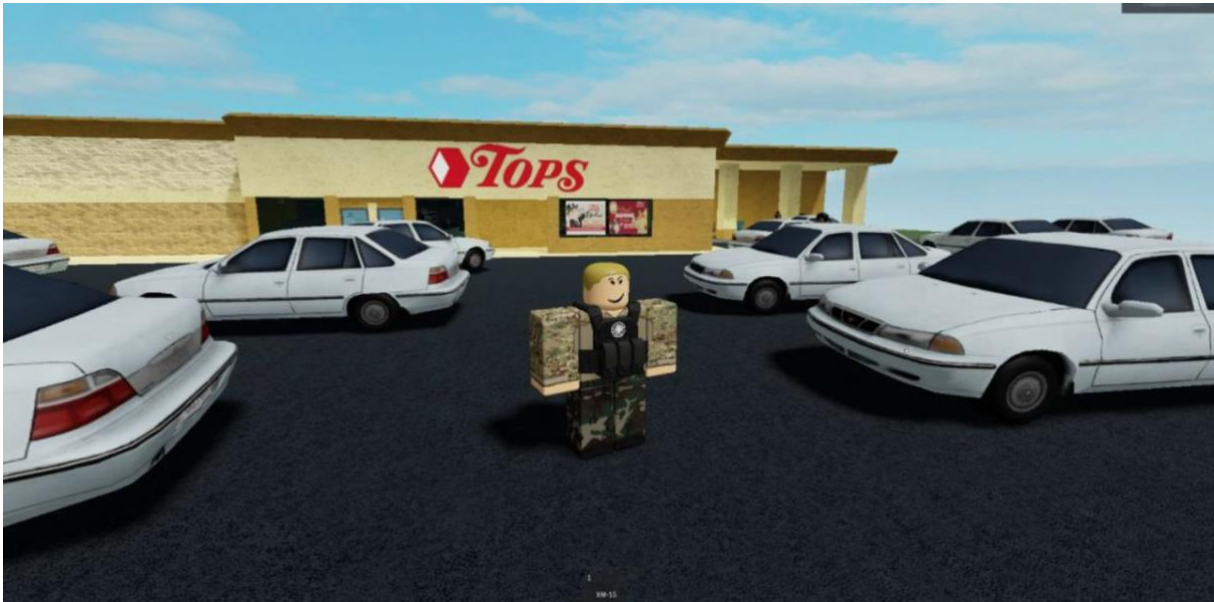
Figure 4: Right-wing extremist "experience" on Roblox. Here, players can re-enact the Buffalo attack

The attacks in Christchurch and Halle were available on the platform until the moderators reacted months later. 25 The far right primarily uses gaming areas where they can create and design their own content. Sandbox-like game concepts such as "Roblox" and "Minecraft" are used here, as well as the workshop area of Steam. Modifications (mods) for existing games can be developed here. This includes mods in which players can play as the Waffen SS, a legitimate faction in "Company of Heroes", or select Adolf Hitler as head of state in "Civilization VI". 26 Therefore, it primarily utilizes existing gaming infrastructures in which right-wing extremists push their "meta-politics". Occasionally, neo-Nazis also try to develop their own propaganda games, such as a right-wing developer studio belonging to the "Identarian Movement. In this game, players can choose a cadre figure from the so-called "new right" and fight against right-wing enemies as Martin Sellner or Alexander "Malenki" Kleine in a dystopian 2D pixel platformer. 27 Developing independent VR games does not seem to be a priority for right-wing extremist groups.