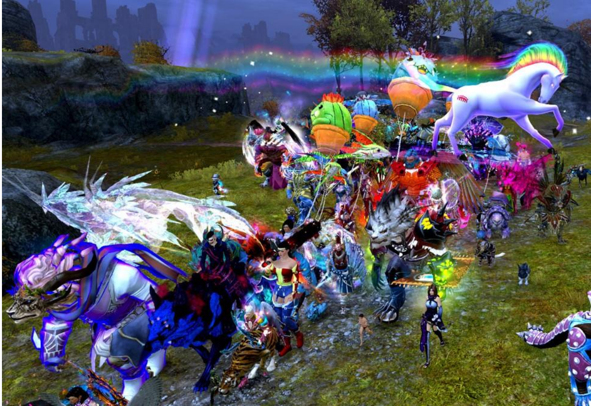
Figure 6: Pride Parade in the game Guild Wars 2; once a year, players organize a solidarity demonstration for the LGBQIA+ community, source: Guild Wars 2, 2022

worlds of "The Sims" and "Animal Crossing" show their solidarity with the Black Lives Matter movement by designing cosmetic clothing with BLM lettering and highlighting everyday racism and discrimination in digital demonstrations (Kotaku, 2020). 34 In response to the Russian invasion of Ukraine, players in the world of "The Elder Scrolls Online" took a stand and organized a march for peace for those affected in Ukraine (mmos, 2022). 35 Democratic protests are no longer a rarity, especially in online video games where gamers create their own avatars and organize themselves into player communities.