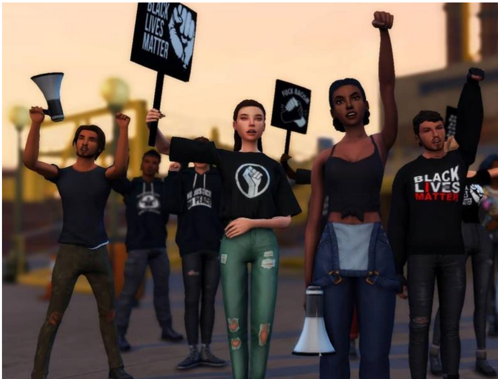
Figure 2: Black Lives Matter protest in The Sims 4

It is also noticeable that many online video games enable multi-layered interaction options with other entities. One example of this is the escapist simulation game „Animal Crossing: New Horizons“. A game mechanic here makes it possible to visit neighbouring islands of other players. In addition to social interaction opportunities, a visit can also be economically motivated. Different islands mean potentially different beet prices – a rare commodity for which prices vary daily and are different on different players’ islands. The focus here is less on social motives and more on the capitalist maximization of one’s own money within the game cosmos. 8 In addition to these obvious forms of interaction dictated by the game, Animal Crossing has also attracted attention through political protest. Players join forces and demonstrate in favor of a free Hong Kong, the anti-racist Black Lives Matter movement, or against toxic corporate structures in gaming companies. 9